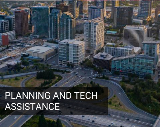
PLANNING AND TECH ASSISTANCE