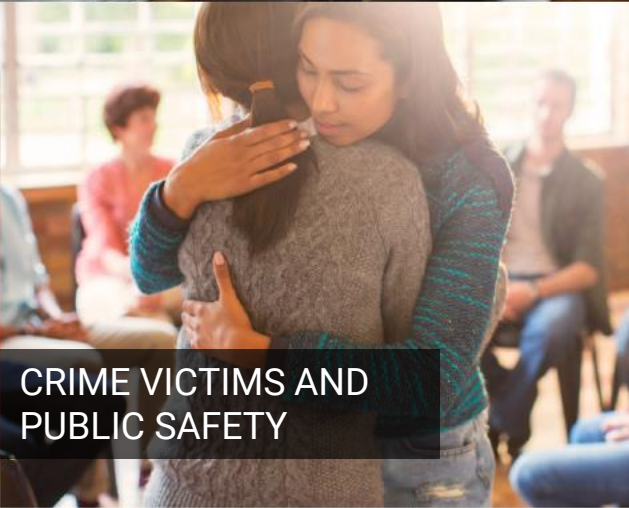
CRIME VICTIMS AND PUBLIC SAFETY