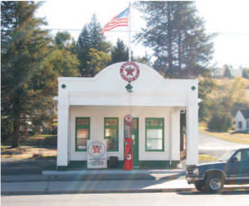
This former gas station in Rosalia is now an interpretive and informational visitor's center. The center promotes the resources and historical assets of Rosalia and surrounding towns in Whitman County.