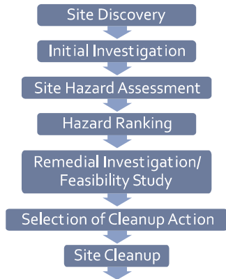
Figure 1: Steps in the MTCA Cleanup Process. Consult the rules for specific requirements for each step in the cleanup process found in chapter 173-340 WAC.