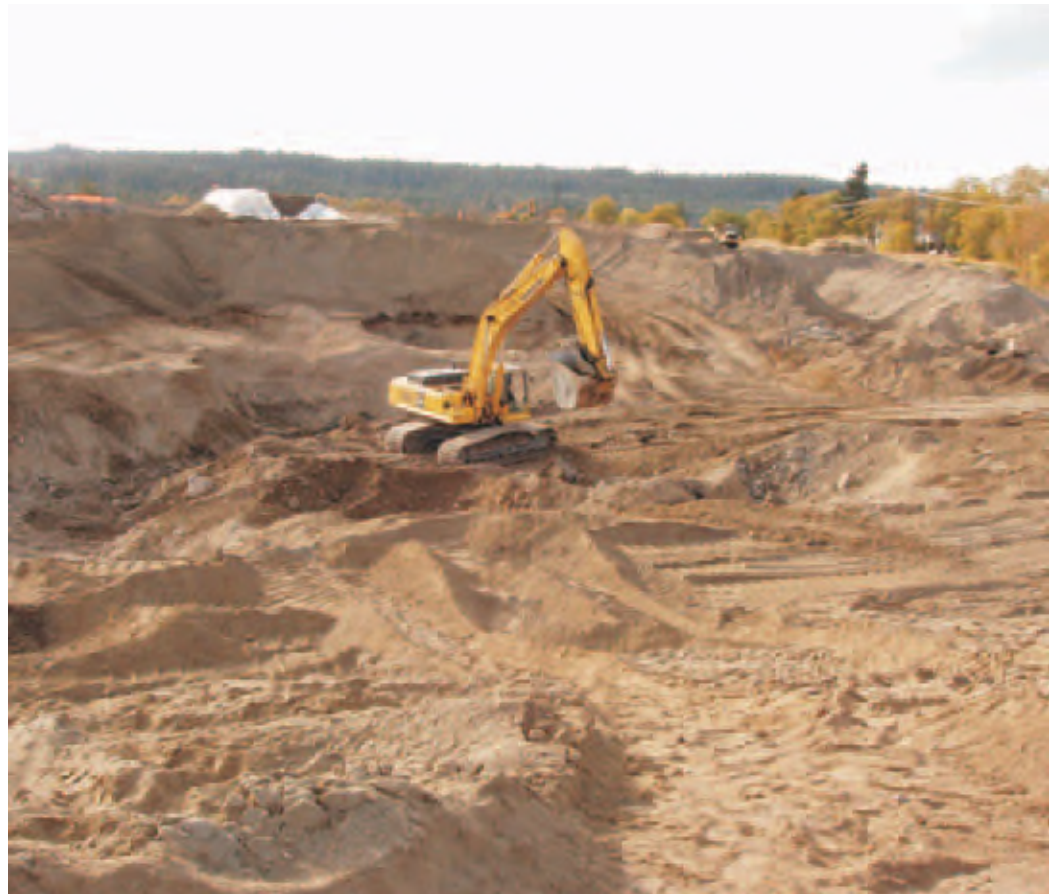
The Kendall Yards redevelopment along the Spokane River in Spokane will connect to the downtown and provide residential and retail space.

Because the amount of cleanup needed can be highly dependent on future use, it is very important to thoroughly assess the property in the early planning stages of your project. The assessment information may allow you to design appropriate but cost effective cleanup options that can be incorporated into the redevelopment process.