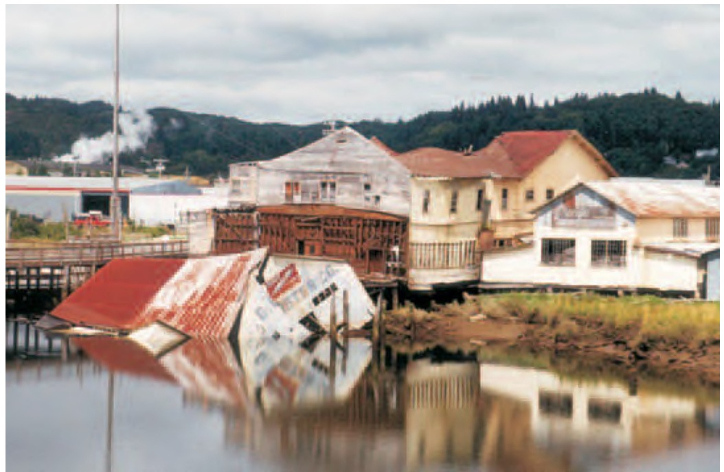
Pacific Wholesale in Raymond, WA with once dilapidated buildings, pictured here, was redeveloped into Riverfront Park. This park promotes tourism and provides public access to the Willapa River while creating economic development and job growth.

If the answer to any or all of the above questions is yes, your community may want to consider forming a revitalization team. This team is typically a mix of public and private parties from your community who have an interest in fostering well-planned, successful cleanup and redevelopment. The team can be large or small, formal or informal. It can be tailored to the size and complexity of one specific project, or it can guide an entire revitalization vision. It can be made up of elected officials, planners, attorneys, environmental professionals, economic development officials, members of environmental interest groups, home owners and the like. The team can bring valuable perspectives from each member's area of ex-