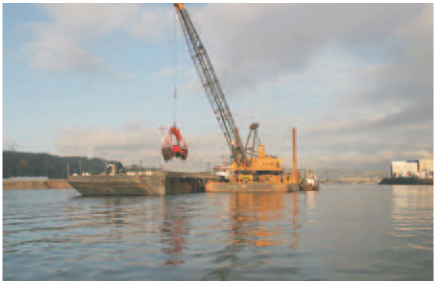
The Toxics Cleanup Program designed a “bay-wide” or geographic approach to cleanup Puget Sound Initiative Sites. This is allowing faster cleanups than the traditional site-by-site cleanup method.

In cases where the cleanup does not remove or address all of the contamination at the property to the most stringent of standards (e.g., for residential or unrestricted use), Environmental Covenants (ECs) may be required as part of the cleanup. ECs are legally enforceable restrictions, conditions, or controls that limit or prevent the use of the property, ground water, or surface water so that future exposure to contamination can be prevented or minimized.