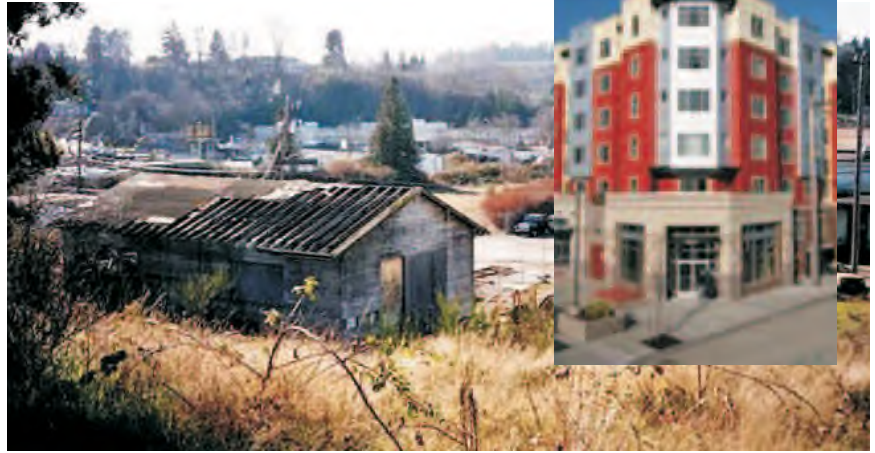
Rainier Court in Seattle is reclaiming seven acres of contaminated land for affordable housing, commercial space and pedestrian activity.

On the other hand, you may have decided not to clean up the property yourself, but instead to market it for simultaneous cleanup and redevelopment. This is most likely to be successful when contamination at the property has been quantified and final cleanup costs can be determined with certainty.