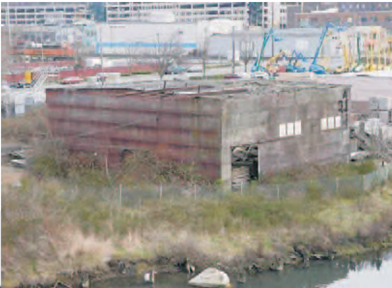
The Department of Ecology cleaned up large sections of the Thea Foss Waterway in Tacoma, WA. The area is now a bustling waterfront with restaurants, museums, condominiums, and public access to the waterway.

When land available for new development is expensive and scarce, brownfields properties can offer significant benefits