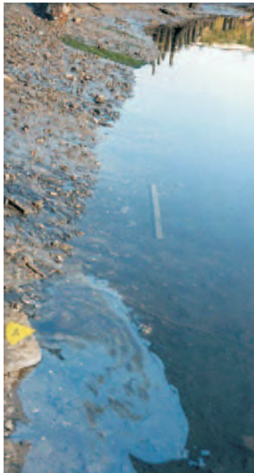
An oil sheen on the Thea Foss Waterway before cleanup.

http://www.mrsc.org/subjects/econ/ed-revitalization.aspx