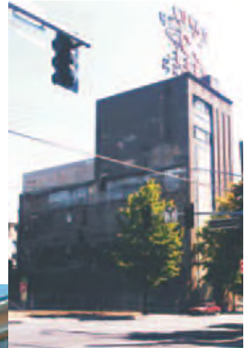
The former Lucky Brewery site, now apartments in downtown Vancouver, has helped revitalize the city center along with Esther Short Park.

promoting the cash flow advantages of tax incentives; promoting the financial and public relations advantages of participating in contaminated property redevelopment to lenders; tapping into programs to expand capital access for small businesses that could locate at a redevelopment site.